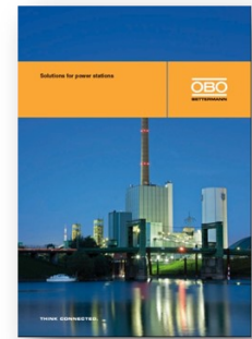
Solutions for Power Stations