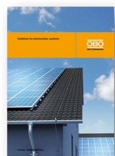
Solutions for Solar Systems