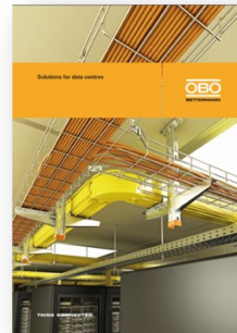
Solutions for Data Centres