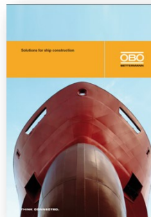
Solutions for Ship Construction