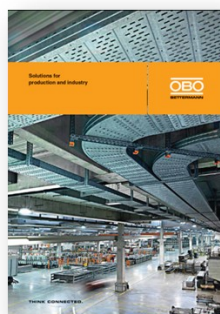
Solutions for the Manufacturing Industry