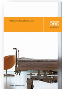
Solutions for Health Care Sector