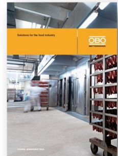
Solutions for the Food Industry