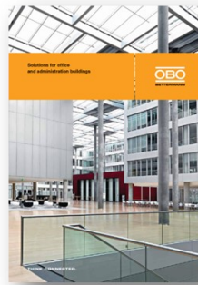
Solutions for Commercial Buildings