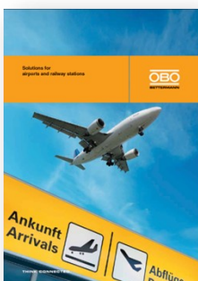
Solutions for Airports and Railway Stations