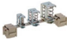
SAB Series with SH1