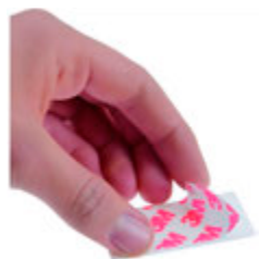
Preparing Adhesive Marker