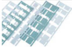
MCGS... Adhesive Markers