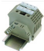
SchT4 fitted with Markers