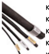
KH and KHE installed