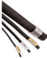
KH and KHE installed