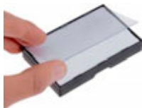
STRMCGSU strips installed