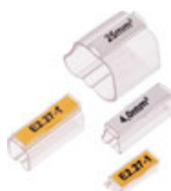
MCESS range with sleeve