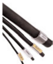
MCESS range installed