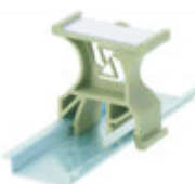
GT2 with Accessories