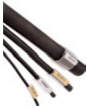
MCESS range installed