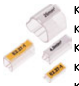
MCESS range with sleeve