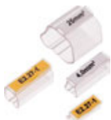
MCESS range with sleeve