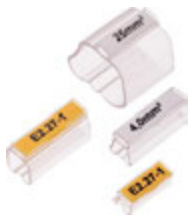
MCESS range with sleeve