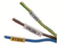
MCESS range installed